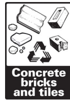
Concrete bricks and tiles

Please join us in building a better tomorrow for our community.