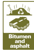
Bitumen and asphalt