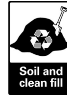
Soil and clean fill